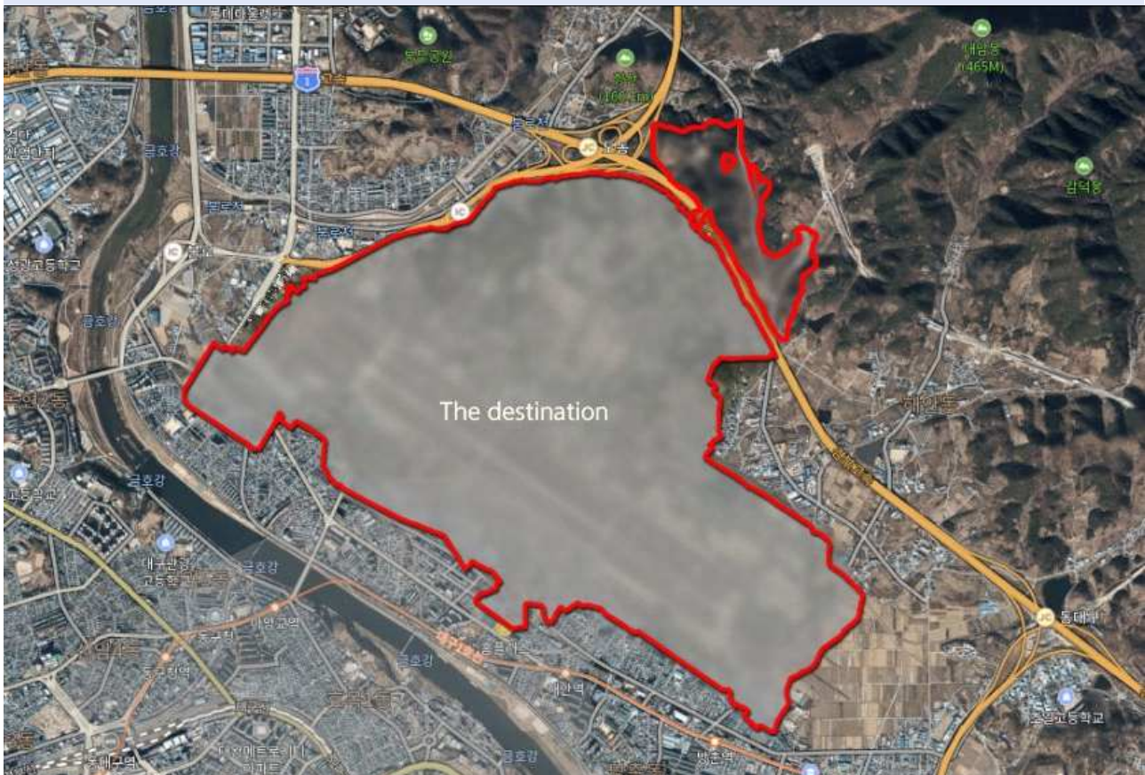
Aerial photos of the destination